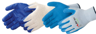
PALM COATED GLOVES