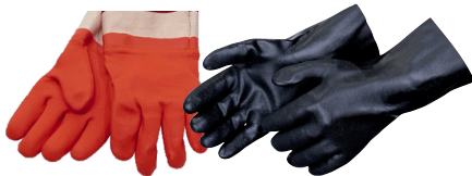
PVC COATED GLOVES