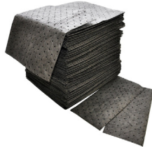
SPILL ABSORBENT PADS